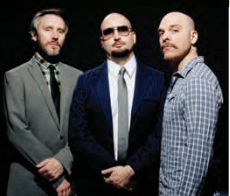
The Bad Plus