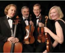
American String Quartet