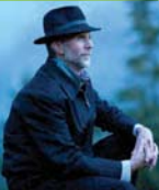
John Luther Adams