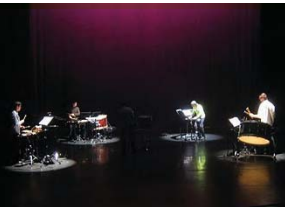
red fish blue fish

(for string quartet, two pianos and strings)