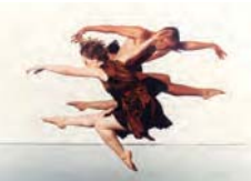
Mark Morris Dance Group

Empire Garden (based on Charles Ives: Trio)